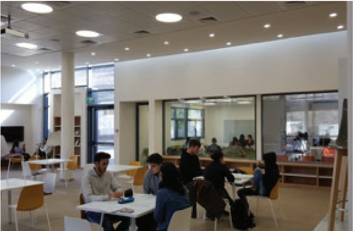
Danciger School, Kiryat Shamona