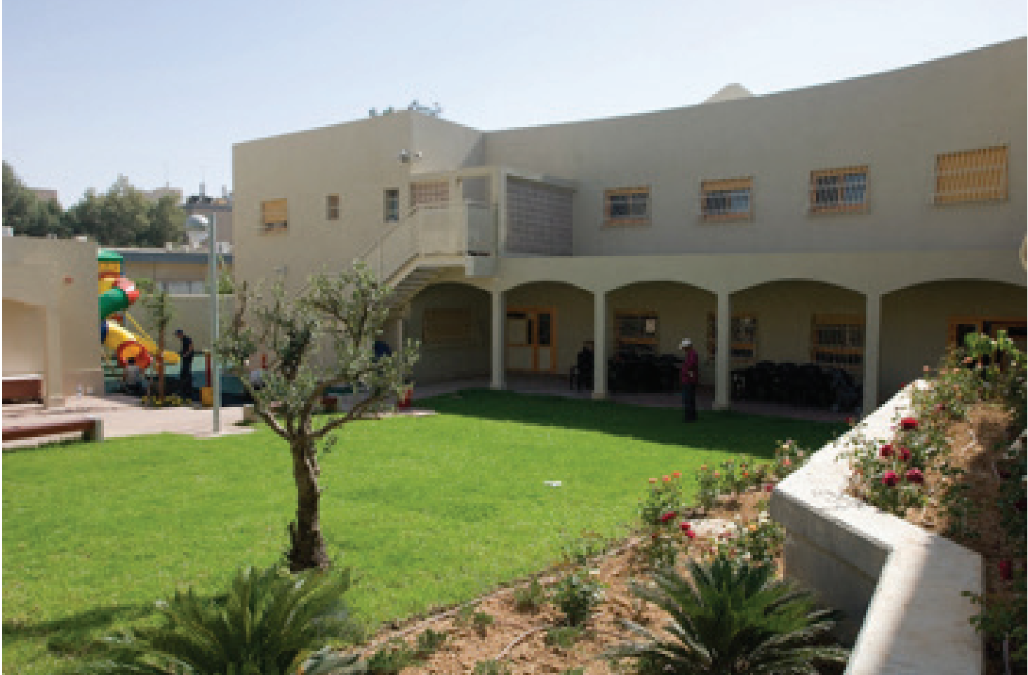
Shelter for Women

In two decades of activity we completed 350 projects at a total budget of ILS 1.5 billion, which serve as infrastructure for social activity.