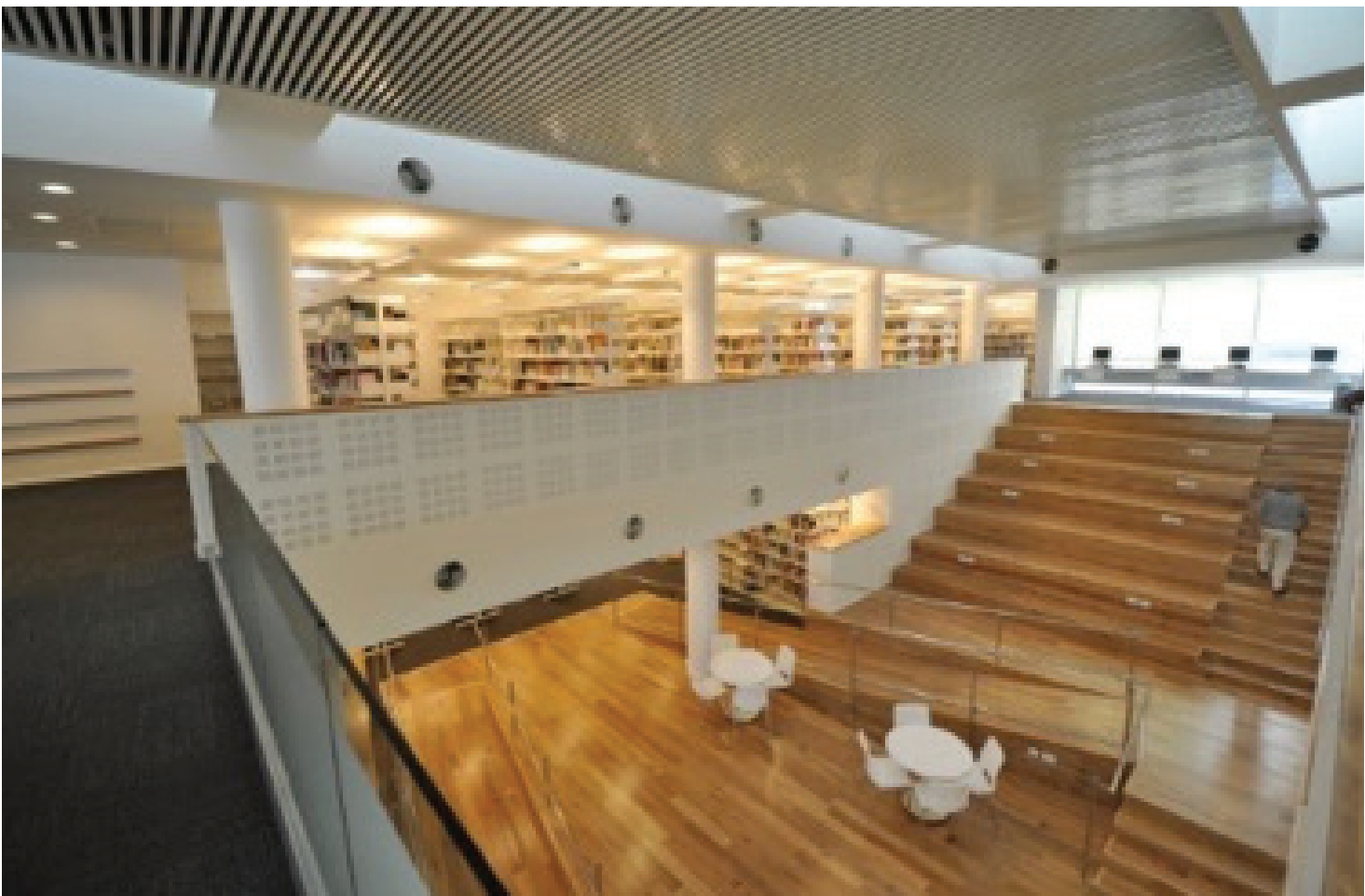
Kinneret College Academic Library